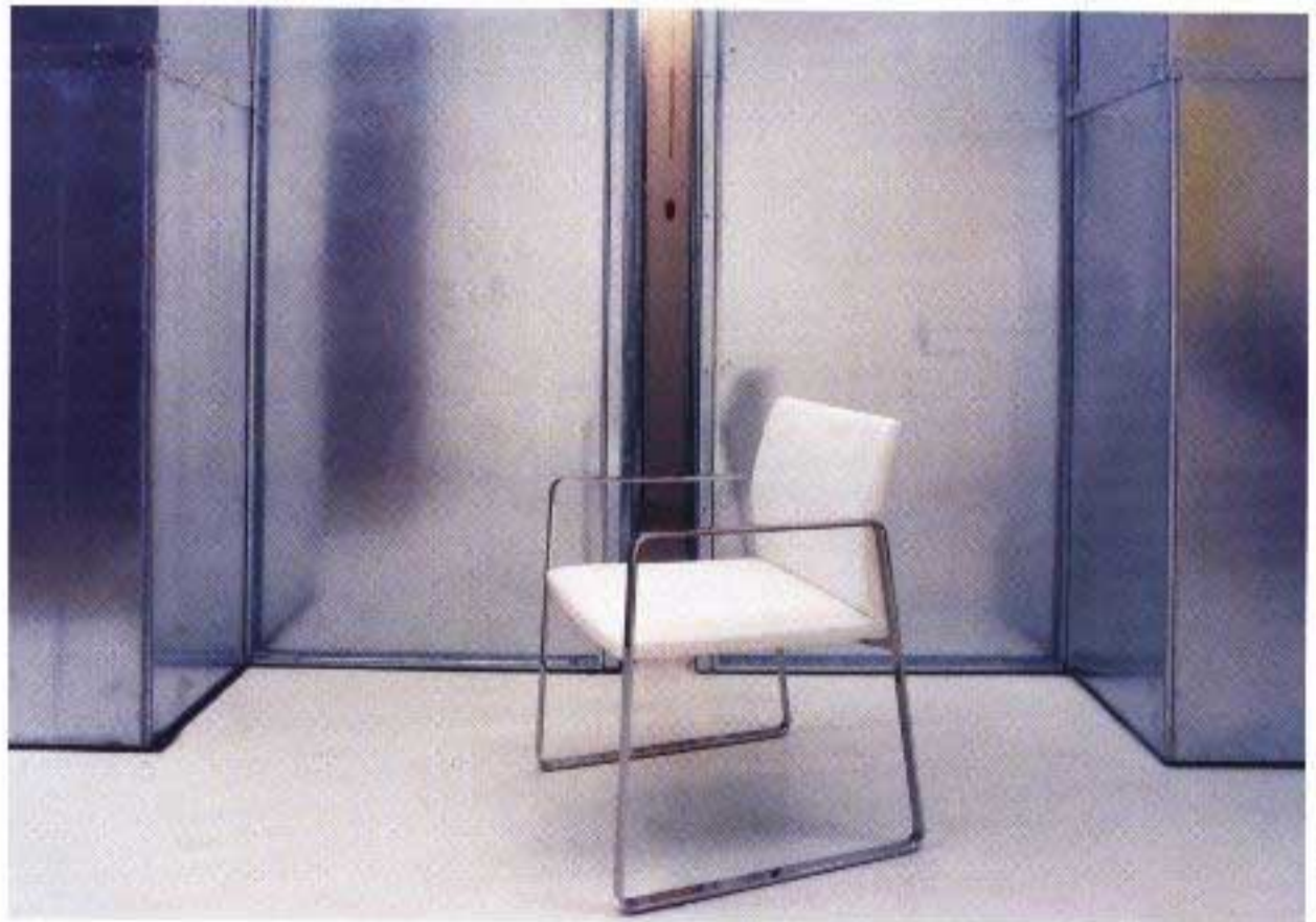
SAWN IN THE USA Top, patterns for chair frames at the Bernhardt Design factory Above, 'Celon' chair by Lievore Altherr Molina, from Global Edition collection

Similarly simple in a complex way is the 'Aro' barstool by the Barcelona-based collective Lievore Altherr Molina. Essentially three loops held together with two legs, the piece may look perfectly weightless but it is incredibly stable as a seat. Its fixed base and revolving seat make it suitable for residential as well as demanding commercial spaces. 'The barstool was the one piece I thought would be hard. I thought the perfect barstool had already»