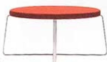
CYCLE coffee table by Hansandfranz Bernhardt Design