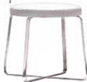
CYCLE coffee table by Hansandfranz Bernhardt Design