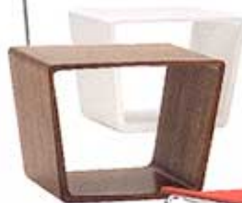
LINC side table by Chase Wills Bernhardt Design