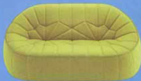
The designer conceived Ottoman while working on a hotel project in Marrakesh. Manufactured by Ligne Roset, the line includes an all-foam loveseat and armchair covered in a quilted upholstery that comes in bold solids or two-toned versions. ligne-roset.com

Zanotta, Ceccotti, Baccarat, Ligne Roset, Bernhardt, Swarovski, Paco Rabanne, L'Oréal