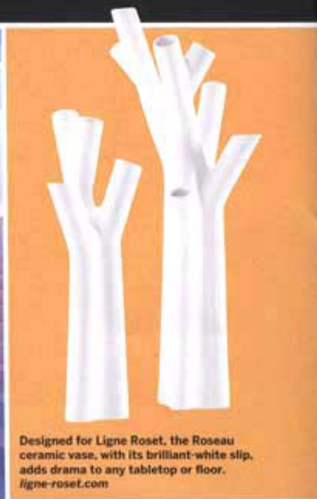
Designed for Ligne Roset, the Roseau ceramic vase, with its brilliant-white slip, adds drama to any tabletop or floor. ligne-roset.com