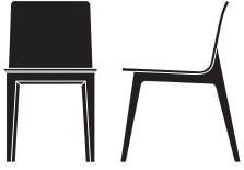
Level I and GREENGUARD Certified