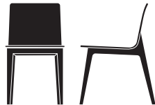
Level I and GREENGUARD Certified