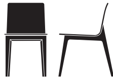
Level I and GREENGUARD Certified