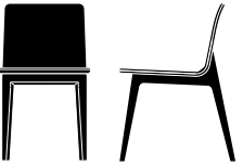
Level I and GREENGUARD Certified

Maple solid base. Upholstered seat. Available in all finishes. When specifying light finishes 836, 837, 840, or 850 the natural characteristics of the wood will be visible. See terms and conditions. Pile fabrics and certain patterned or striped fabrics are not suitable for application. Solids, textures and leathers are recommended. Consult your sales representative for Bernhardt Textiles suitable for application on this product. *All COM/COL fabrics must be preapproved by Bernhardt Design prior to application. Approved for GSA. Contract GS-28F-7040G.