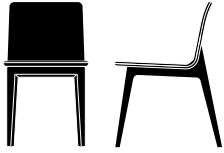
Level I and GREENGUARD Certified

Walnut solid base. Upholstered seat. Available in 823, 839, 841, 860, 861, 101 and 108 finishes. Pile fabrics and certain patterned or striped fabrics are not suitable for application. Solids, textures and leathers are recommended. Consult your sales representative for Bernhardt Textiles suitable for application on this product. *All COM/COL fabrics must be preapproved by Bernhardt Design prior to application. Approved for GSA. Contract GS-28F-7040G.